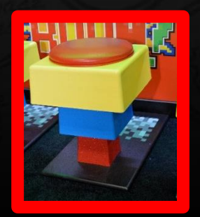
Features: Custom Seats