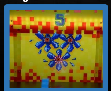
Features: Multiple Chasing Targets.